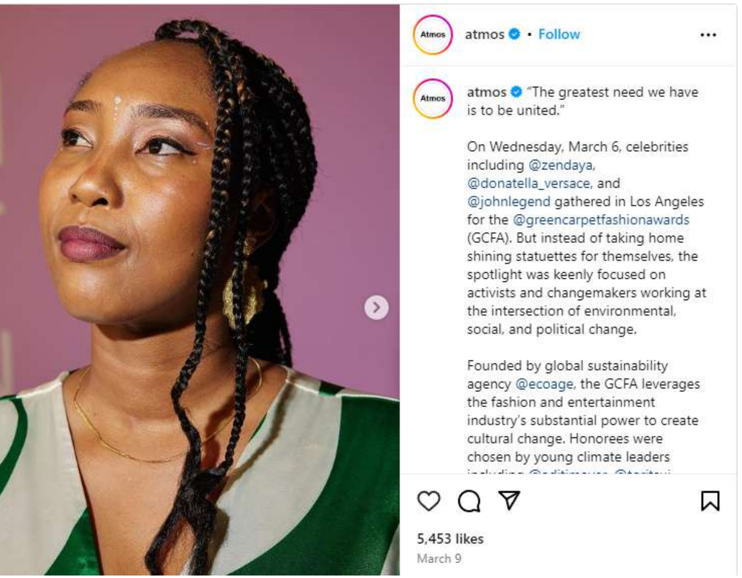
Atmos Climate & Culture Platform 306k Followers